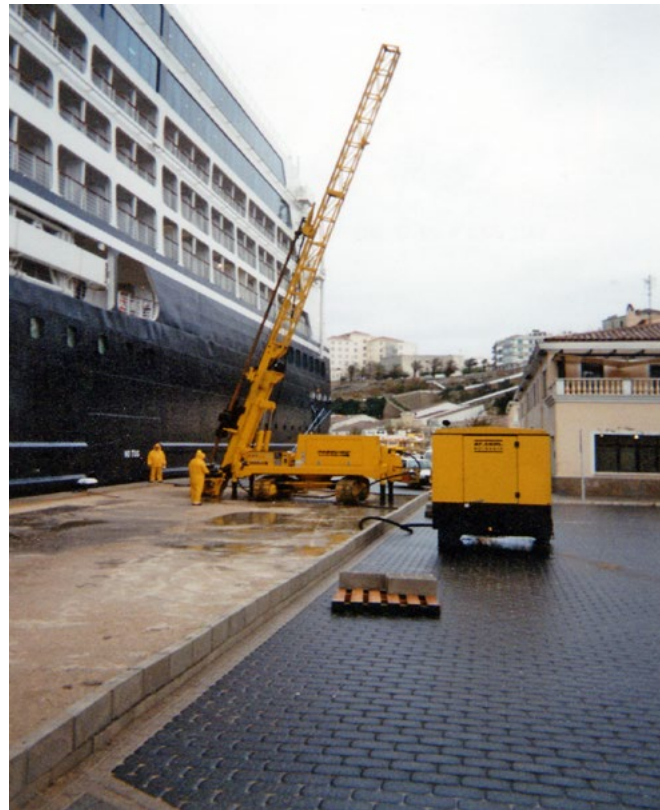
Fig. 3. P 1500 EC drill rig during Jet Grouting.

Two different batteries of rods and drilling tools were used, one for drilling the holes and the other for the injections. The perforation was done with a down-the-hole hammer with air circulation, equipped with a 220 mm bit to facilitate subsequent laying of the injection battery and circulation of the injection fluids. The injection was made using a battery of rods for the PS1 system of Jet Grouting PS1, equipped with a triple blade measuring 101 mm diameter (Fig. 3).