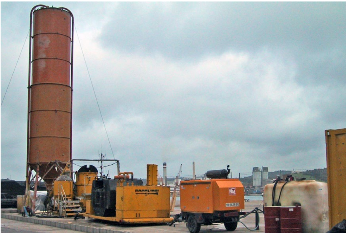
Fig. 4. View of the worksite.