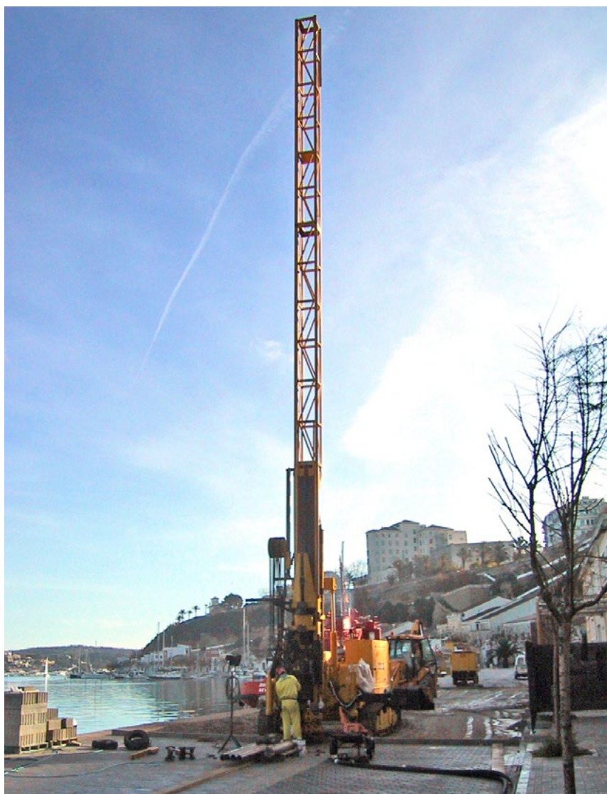
Fig. 1. P 1500 EC drill rig on the wharf.